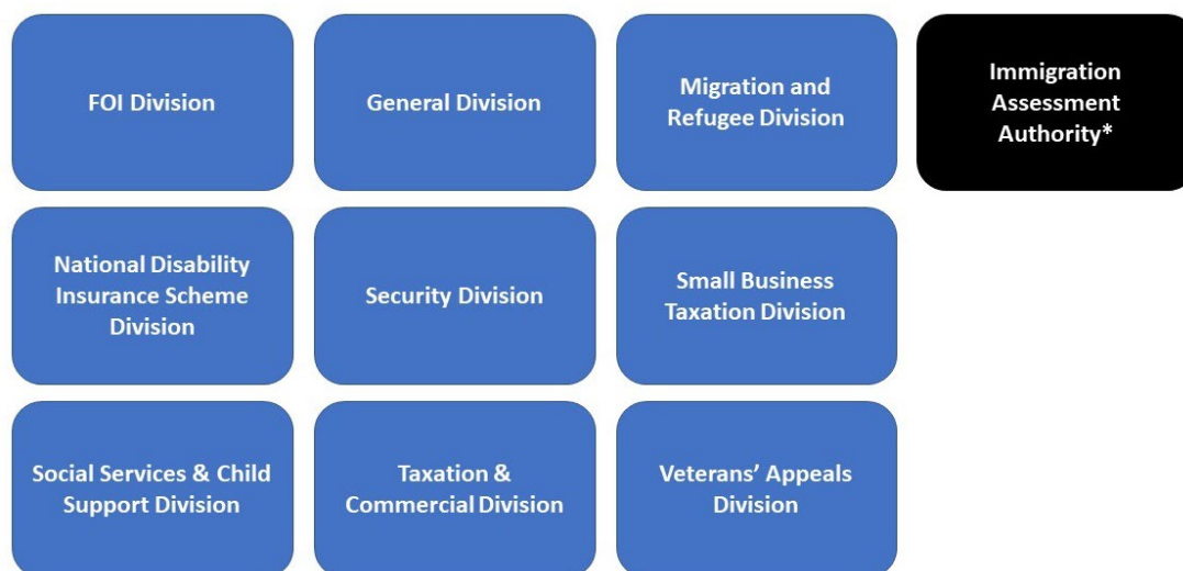
Figure 2 – Current divisions of the AAT

*The Immigration Assessment Authority (IAA) is an independent authority to review 'fast track reviewable decisions' for decisions by the Minister, or delegate, to refuse to grant a protection visa to certain applicants. It is not a division of the AAT. Unlike the remainder of the AAT, decision-makers in the IAA (the Senior Reviewer and Reviewers) are APS staff and not statutory office holders.